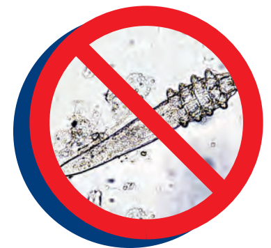
Enlarged view of Demodex

In a recent study 3 , OCuSOFT® Lid Scrub™ PLUS, in its unique "Leave-On" formulation, demonstrated to effectively kill Demodex. Significantly, NO other eyelid cleanser used according to manufacturer's instructions killed Demodex.